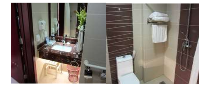
Bathrooms in bedrooms